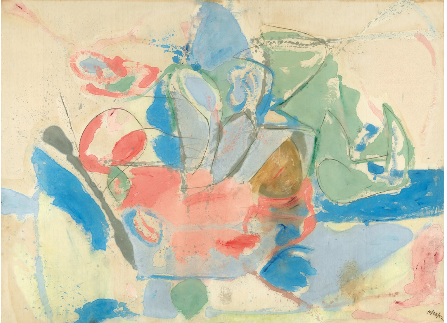
Helen Frankenthaler, Mountains and Sea , 1952, oil and charcoal on unsized, unprimed canvas, 86 \frac{3}{8} × 117 \frac{1}{4} inches (219.4 × 297.8 cm). Helen Frankenthaler Foundation, New York. On extended loan to the National Gallery of Art, Washington, DC

She would have long known of Monet's late Nymphéas paintings—and there was a big Monet exhibition at the Museum of Modern Art in the spring of 1960, explicitly designed to link his work to Abstract Expressionism. However, the comparison of a typical Nymphéas painting with Cape (Provincetown) only emphasizes the difference between an oblique view across water and a flat chart.