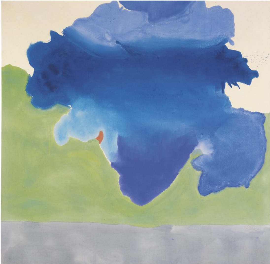
Helen Frankenthaler, The Bay , 1963, acrylic on canvas, 80 \frac{3}{4} \times 82 \frac{1}{8} inches (205.1 \times 208.6 cm). Detroit Institute of Arts, Michigan

The Bay , painted in acrylic in 1963, shows the result. I think it is clear enough how Frankenthaler has pulled together the geometry of the square canvas of Swan Lake I with a soft island shape like those of Seascape with Dunes , but massively expanded, as if we are closer to it—and yet, given the size of the painting, at almost seven feet square, asking us to move further away. This is a big change for her, seeming at once a view onto a bay and a map of a bay.