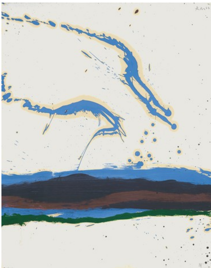
Robert Motherwell, Beside the Sea No. 18 , 1962, oil on paper, 329 × 23 inches (73.7 × 58.4 cm) © Dedalus Foundation, Inc./Licensed by VAGA at Artists Rights Society (ARS), NY

Following this interpretation, we might say that Frankenthaler, looking at water behaving in a quieter, slower manner as the tide recedes, also imitates it by employing a quieter, slower process in painting it. And that for her, too, the colors and the forms of her paintings occupy a terrain that is somewhere between description and metaphor—neither solely a pictorial likeness of a view of nature, nor solely a pictorial analogy of it created by imitating the process that formed it.