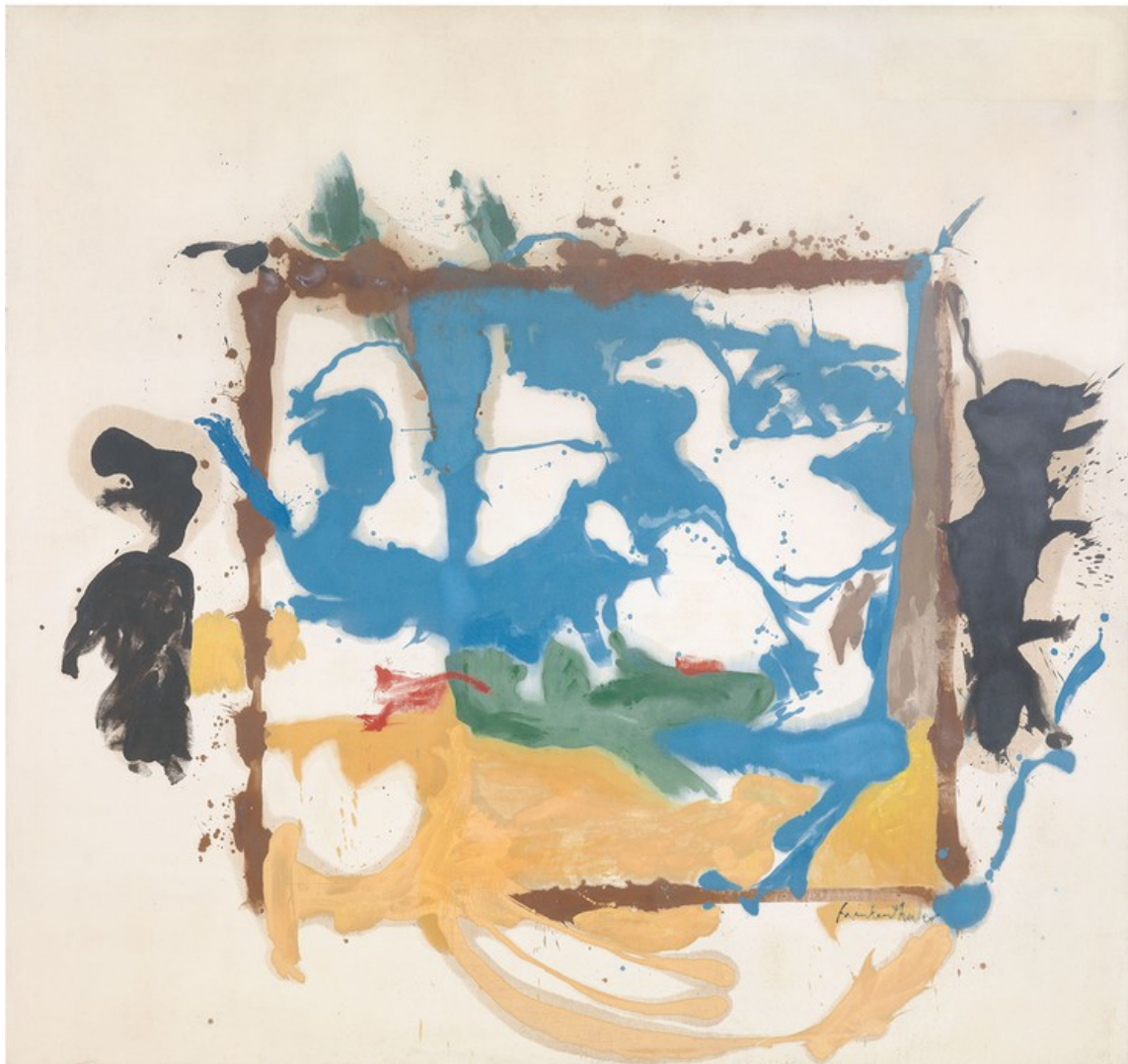
Helen Frankenthaler, Swan Lake I , 1961, oil on canvas, 89 1/8 × 91 3/4 inches (226.4 × 233 cm)

Being an inductive leap into unfamiliar territory, it was disconnected from what preceded it, and in 1961 Frankenthaler stepped back a little in order to connect it with the kind of painterly art that she had been making earlier. Hence the loosely painted framing device set within the edges of the canvas of Swan Lake I , a painting about seven and a half feet in height, made that year in New York.