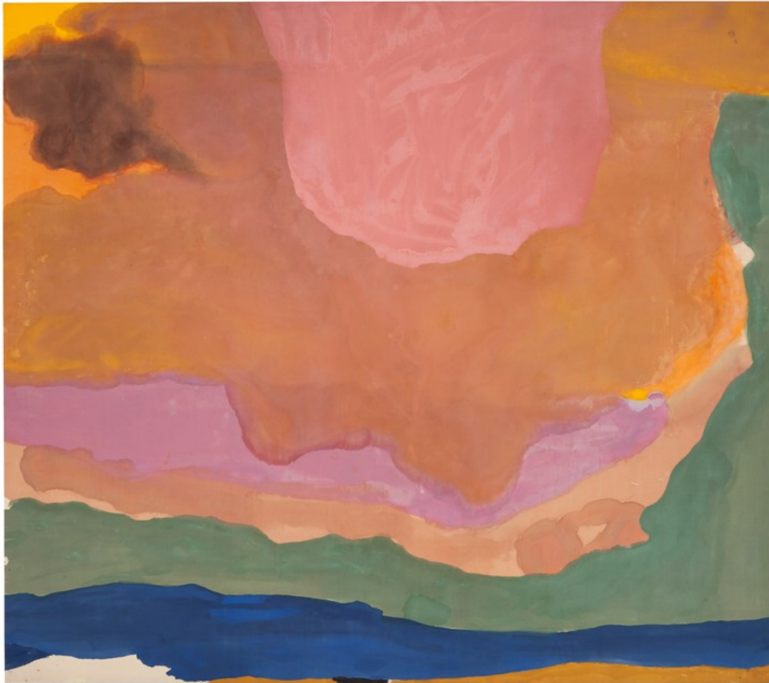
Helen Frankenthaler, Flood , 1967, acrylic on canvas, 124 ¼ × 140 ½ inches (315.6 × 356.9 cm). Whitney Museum of American Art, New York

The beauty of the storm. Or the beauty of its waning.