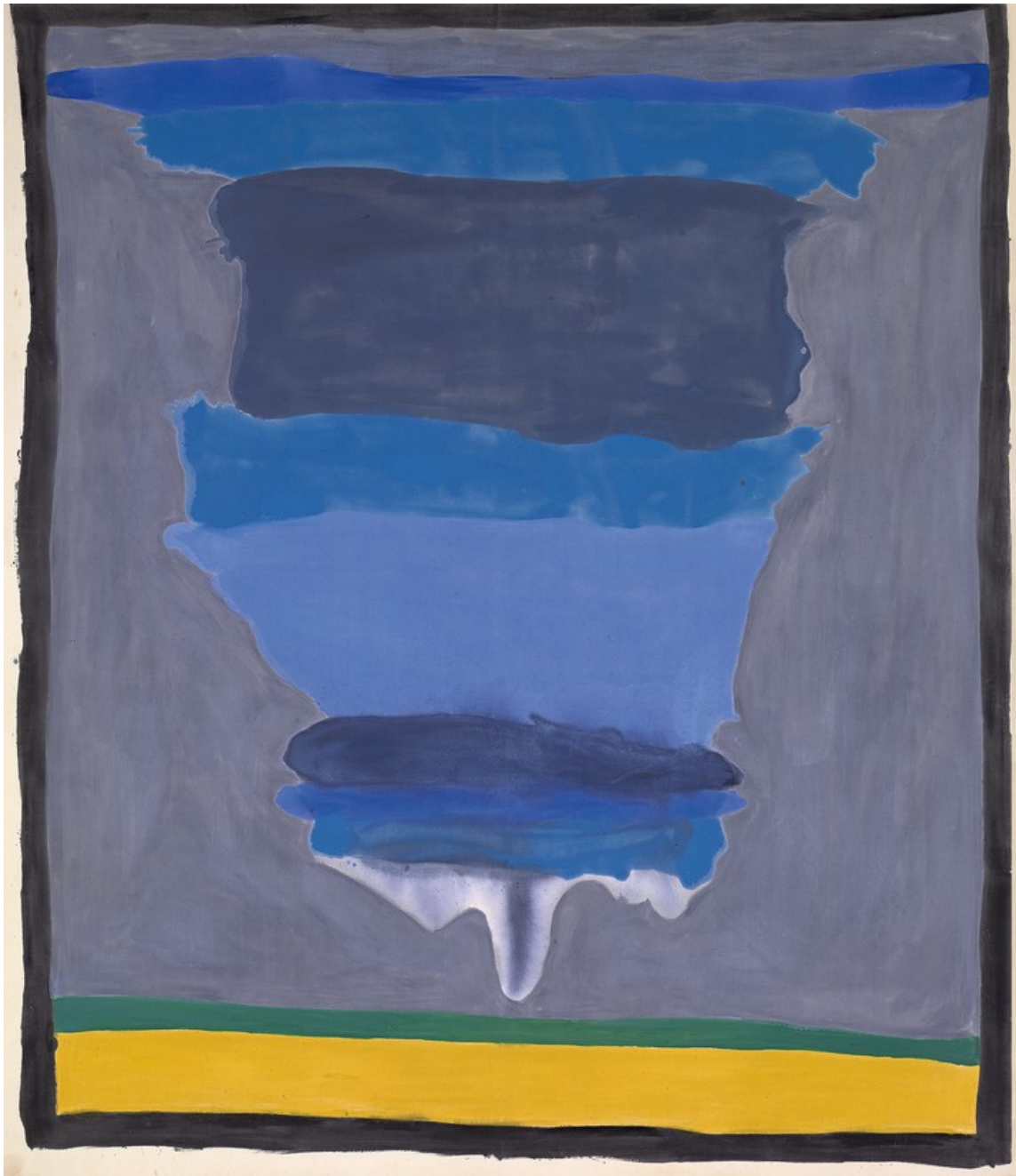
Helen Frankenthaler, Cape (Provincetown) , 1964, synthetic polymer paint and resin on canvas, 109 \frac{5}{8} × 93 \frac{3}{8} inches (278.5 × 237.2 cm). National Gallery of Victoria, Melbourne, Australia

The year after painting The Bay , Frankenthaler made a sequence of even larger canvases, among them Cape (Provincetown) , about nine feet square. These do evoke framed charts of mapped waters to hang on a wall; quiet, flat records of what it felt like looking down into the shallow water of the bay.