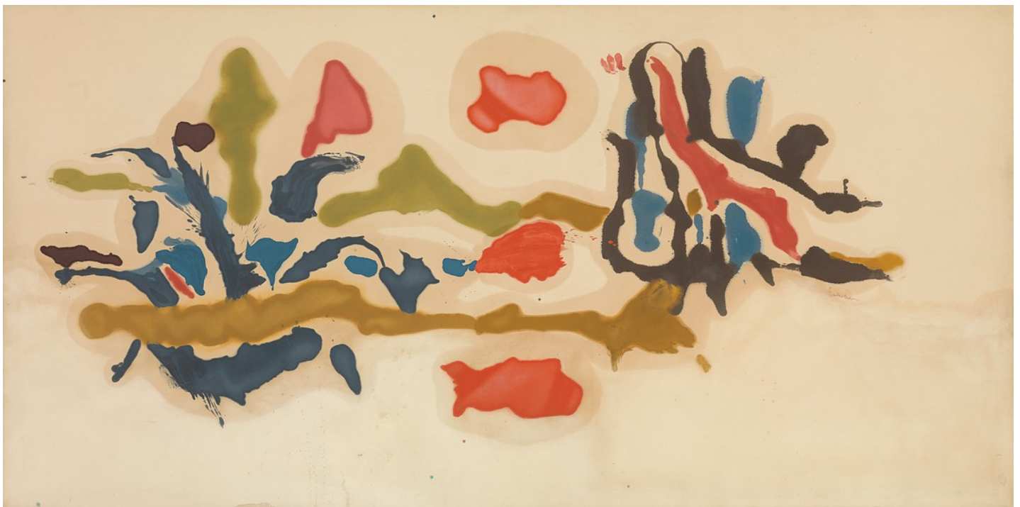
Helen Frankenthaler, Seascape with Dunes , 1962, oil on canvas, 70 × 140 inches (177.8 × 355.6 cm). Grey Art Gallery, New York University Art Collection. Gift of the Artist

At the end of 1961, Frankenthaler had talked of wanting to move from a “very thin stain” to paint that, while still allowed to “get into a pool,” was “thicker and more compact,” producing “a harder edge rather than a blotted edge.” Seascape with Dunes shows that her wants were somewhat ahead of her paintings.